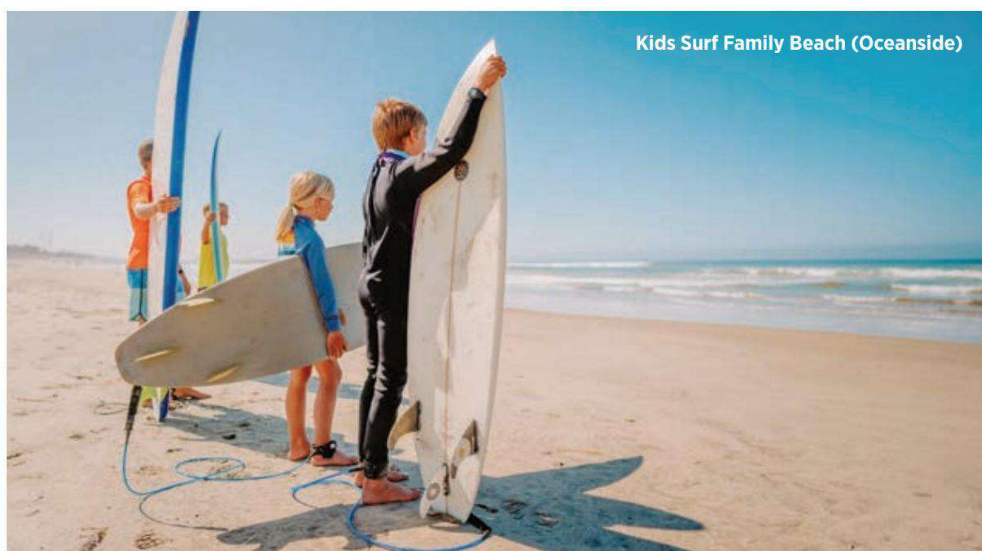
Kids Surf Family Beach (Oceanside)