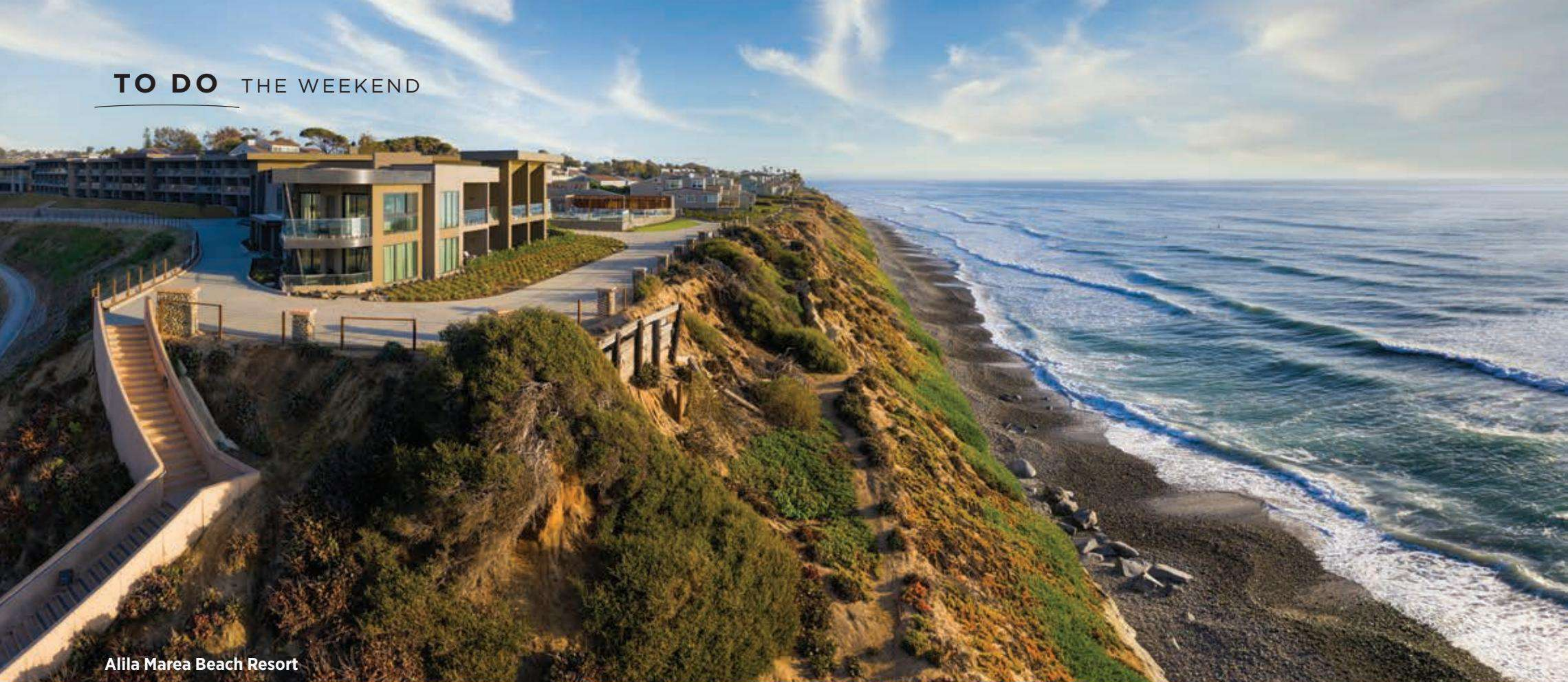
Alila Marea Beach Resort

to the 226-room The Seabird, styled like a California beach house with bright white tongue-and-groove walls and a beachy mix of old and new paintings and photographs. The heart of the hotel, which is especially welcoming to families with children, is the expansive pool and adjacent Shelter Club restaurant and lounge, open to guests of both hotels. missionpacifichotel.com ; theseabirdresort.com