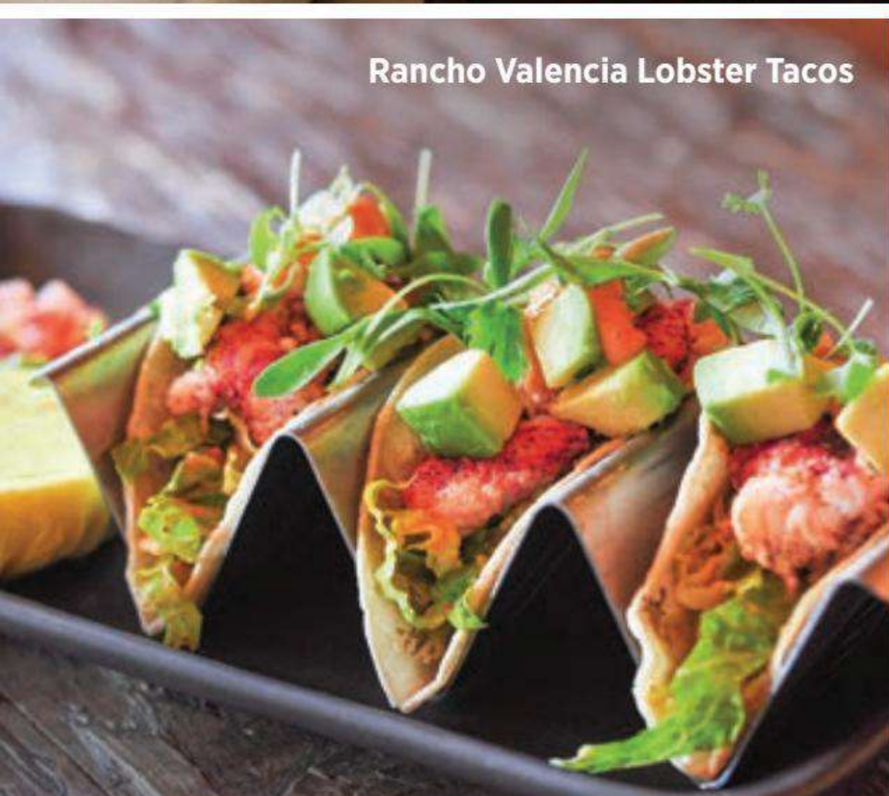
Rancho Valencia Lobster Tacos